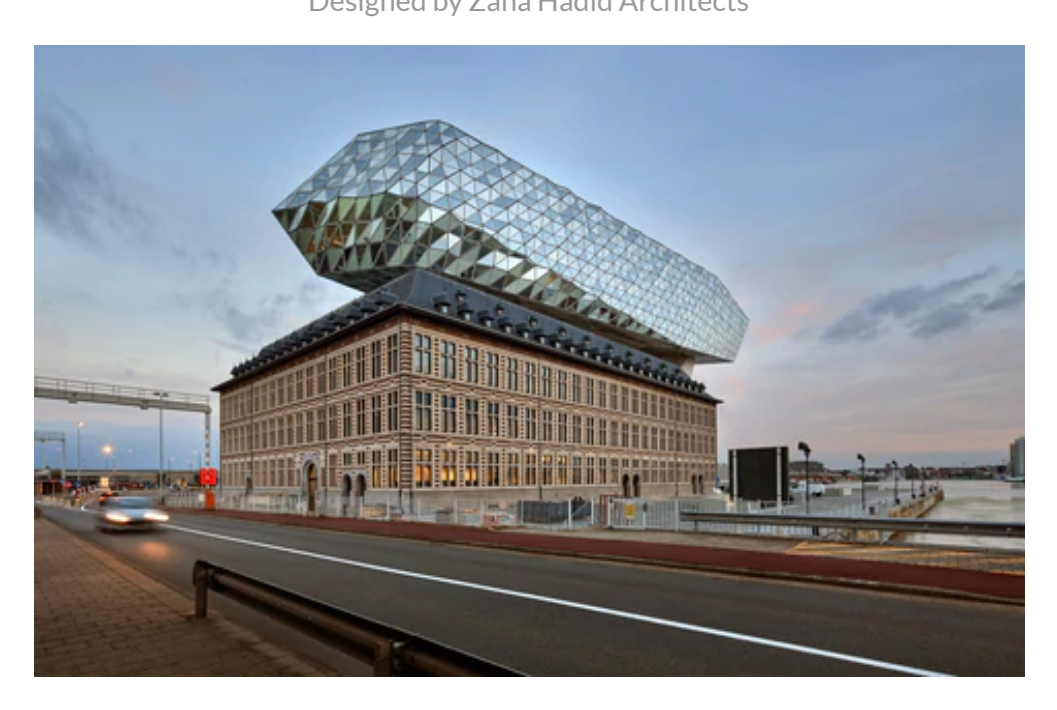
Antwerp Port Authority, Belgium Designed by Zaha Hadid Architects

The context in which Zaha excelled as an architect makes her achievements even more admirable. Sexism in architecture is well documented. The 2017 Women in Architecture survey, completed by 1,277 women and 340 men of whom 70% are based in the UK, revealed that 30% of women would not recommend a career in architecture. Why? "More than half of women surveyed…say they have experienced discrimination, indirect or direct, during the past year, including sexism, bullying and/or sexual harassment" (Architectural Review). If this was the situation in 2017, the year after her passing, one can only imagine the discrimination Zaha encountered throughout her career, respectively.