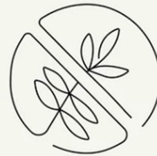
Palm Oil Free