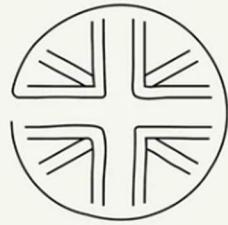
Made in UK